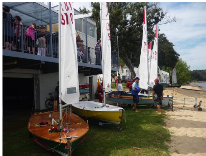
New Sabres at PDSC on Opening Day

Well it's Xmas time again and sailing has been well underway. Sailing numbers have been consistent although we have had a loss of a few members, with new members joining, our numbers are on the upside.