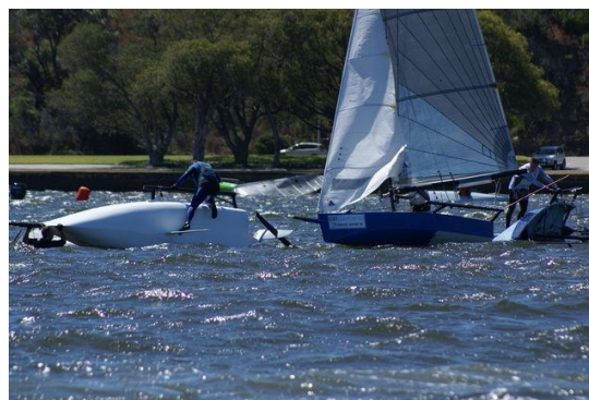
"The word of the day was CARNAGE!!..."